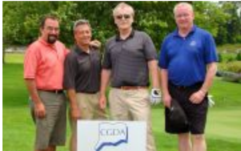
The GGI Foursome