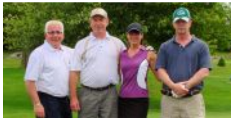
The GGI Foursome