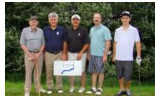
The Leed Himmel Foursome