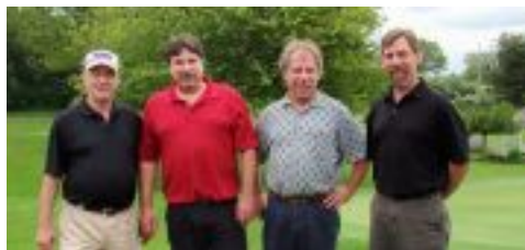
Above: The Tri-State Glass Foursome

General Glass Industries Hart Supply Huntington Glass & Mirror K-Man Glass Manchester Glass McCormac Insurance Agency OldCastle Glass Orchard Glass Distributors, Inc. Pittsburgh Glass Works Robert Noonan & Associates Solar Seal Company Stanley Access Technologies TCORS Capitol Group The Hartford Glass Company Tri-State Glass U.S. Glass Distributors The Wharton Group, LLC