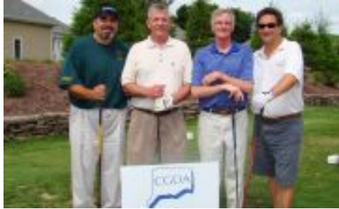
The OldCastle Foursome

A Publication Serving the Connecticut Glass Industry