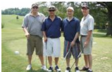
Yankee Aluminum Foursome