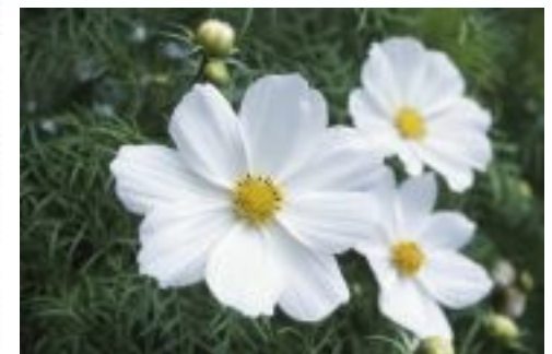
Spring Is Finally Here!!

The Connecticut Glass Dealers Association publishes The Glazier's Point for its members. It is published four times a year. Contributions of all kinds are welcome and encouraged. Letters to the Editor are printed at the discretion of the editorial staff and should be less than 300 words in length. Materials must be submitted to the CGDA headquarters, to the attention of The Glazier's Point . All submitted materials become the property of The Glazier's Point . Materials are subject to review and modification by The Glazier's Point , serving as Editor-in-Chief.