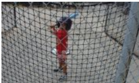
Ed of Apex Glass hitting some softballs!